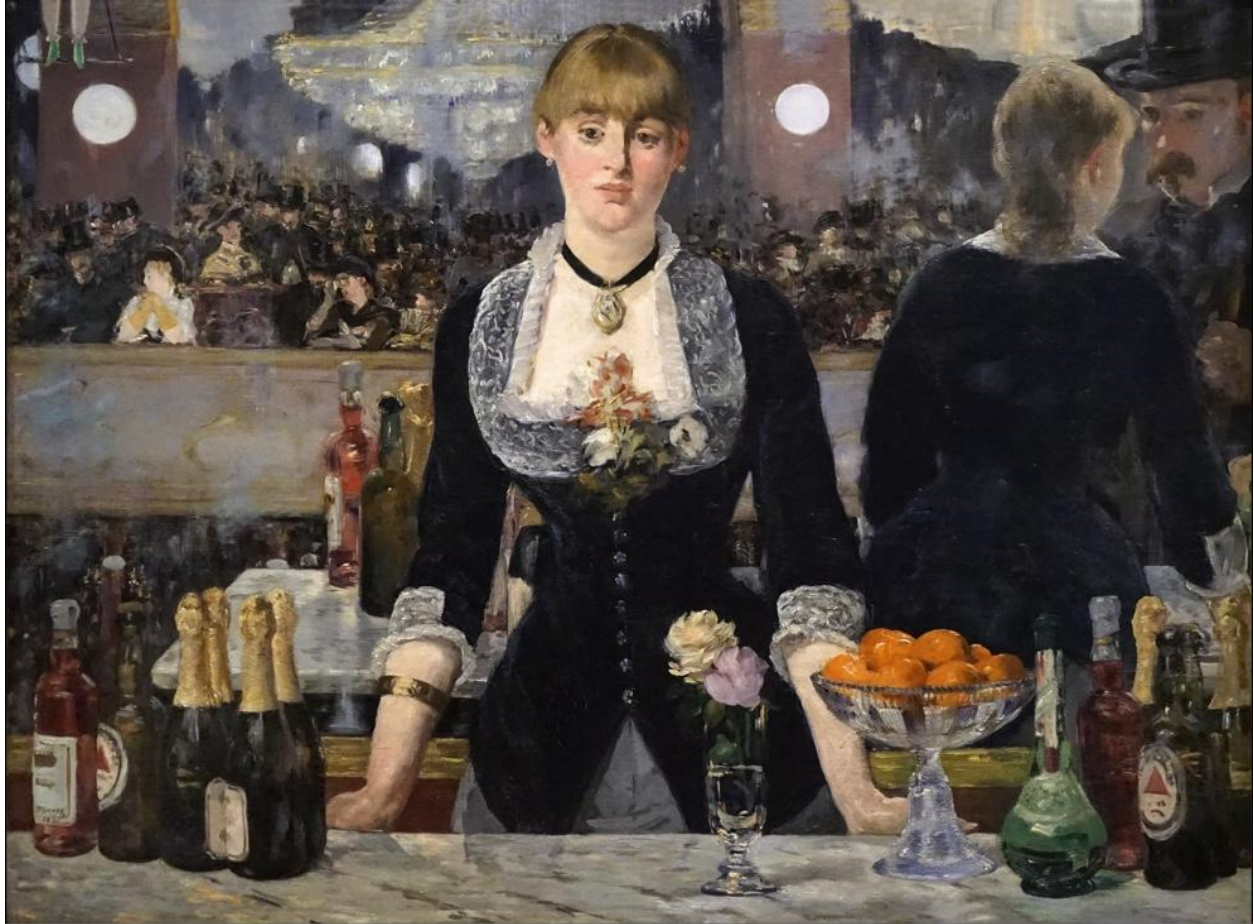
“A Bar at the Folies-Bergere”: Edward Manet

https://en.wikipedia.org/wiki/A_Bar_at_the_Folies-Berg%C3%A8re#/media/File:Un_bar_aux_Folies-Berg%C3%A8re_d'E._Manet_(Fondation_Vuitton,_Paris)_33539037428.jpg